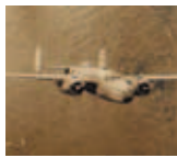
B25C MITCHELL BOMBER PISTOFF Story & Photos: Don Silcock