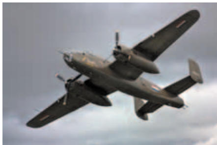
Clockwise from top left: Rear tail fin of Pistoff; Rear gun turret of Pistoff; Rear gun turret of Pistoff, Pistoff's right-hand engine; North American B25 Mitchell; B25 Mitchell "Sarinah".

None of the side doors are open. It appears the crew must have kept them closed to keep the plane afloat for as long as possible and made their exit through the open cockpit canopy.