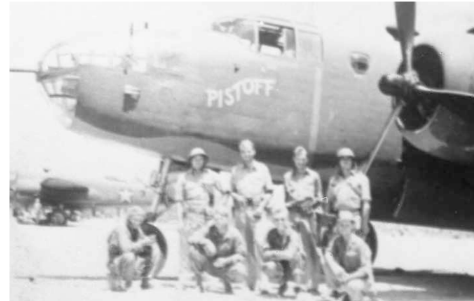
Above: B25 crew pose.

Lett tried to get the plane back to base, but the damaged engine was leaking fuel badly and he was forced to look for a place to land, eventually settling on Collingwood Bay just south of Cape Nelson. The shallower waters and beaches of the bay must have looked a much better option than the deep waters and densely forested fiords of Cape Nelson.