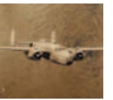
B25C MITCHELL BOMBER PISTOFF Story & Photos: Don Silcock