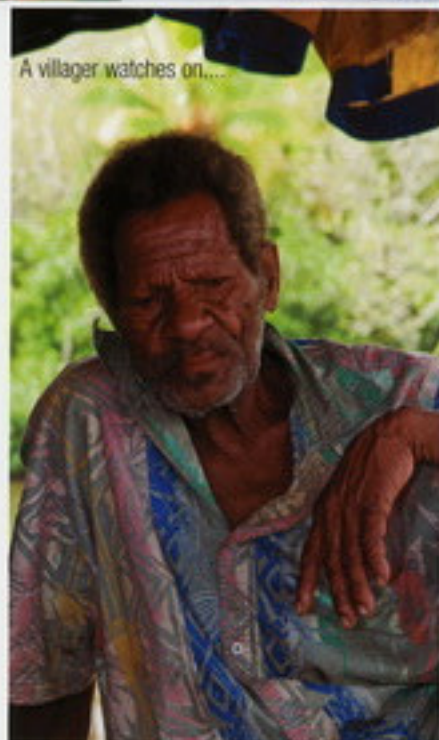
A villager watches on....

Reading copies of Doug & Fif's original trip reports was quite fascinating as they described in detail their treks