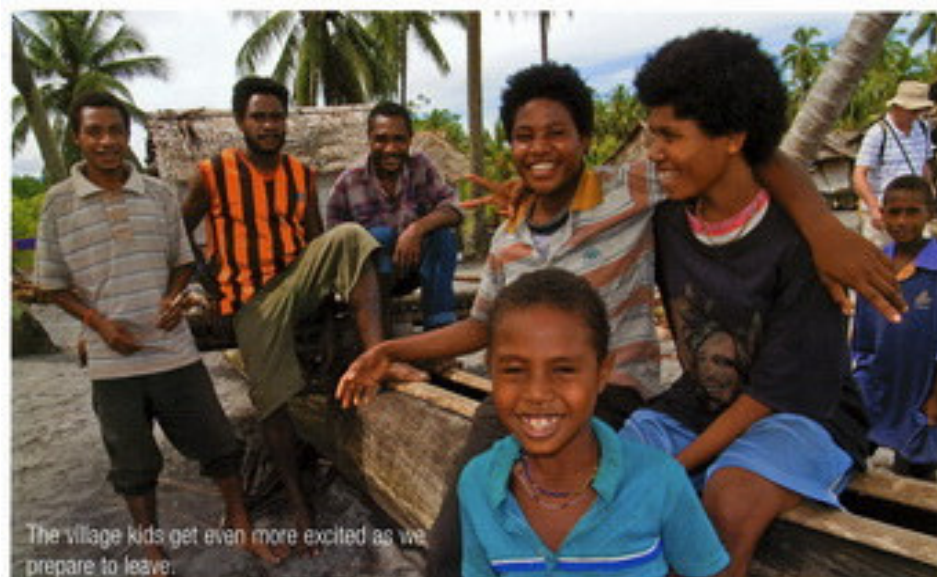
The village kids get even more excited as we prepare to leave.