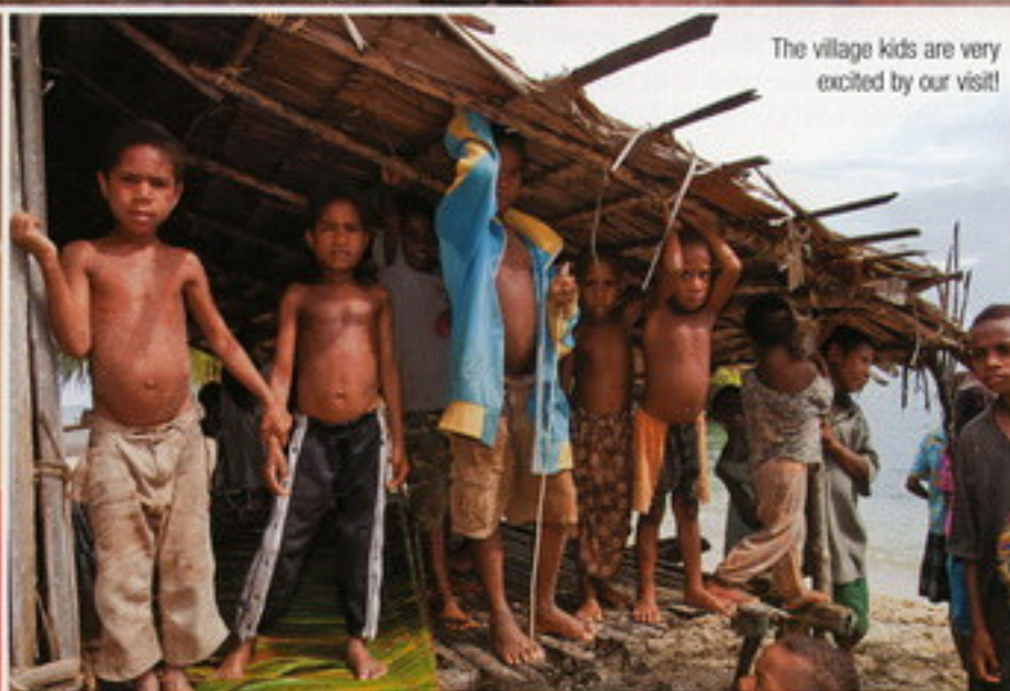
The village kids are very excited by our visit!

talked about area & the people with real affection.