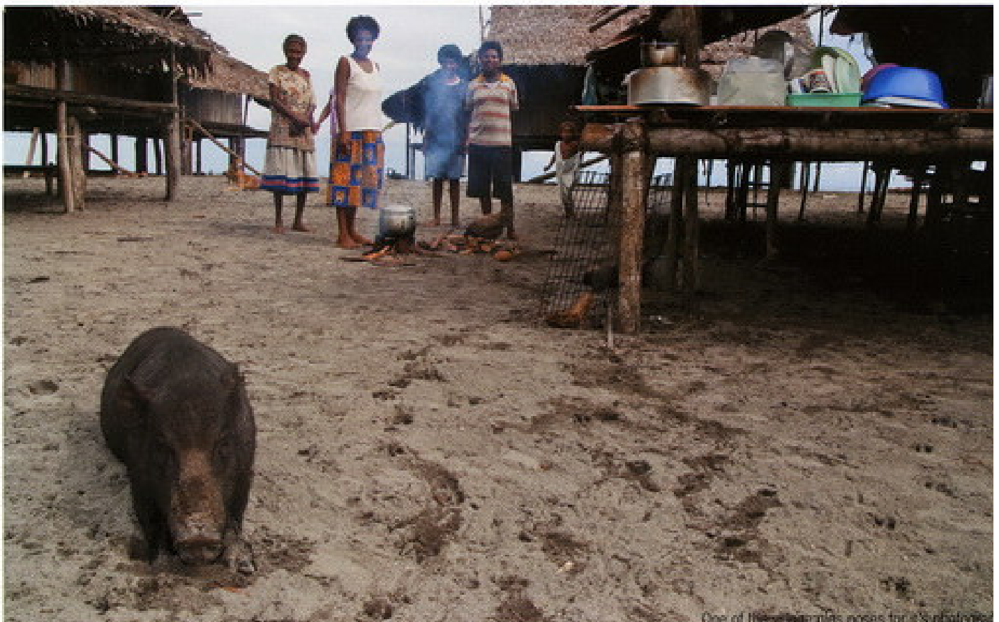
One of the many pigs raised for subsistence.

Frankly, I was expecting both of them to have somewhat of a "colonial attitude" and talk condescendingly about Tufi, but it was quite the opposite and I was pleasantly surprised to hear the way the