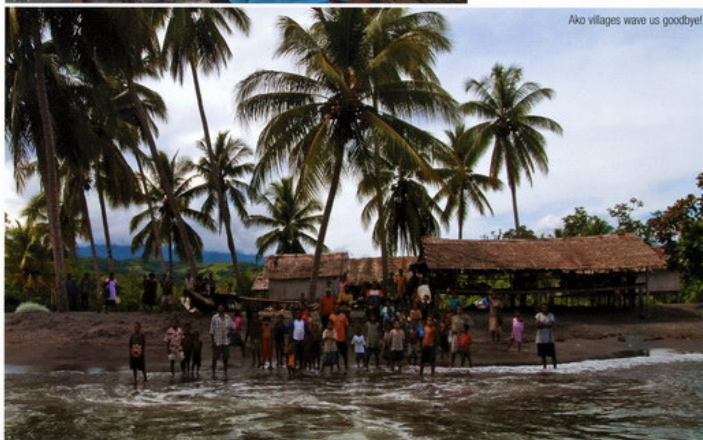
Ako villages wave us goodbye!